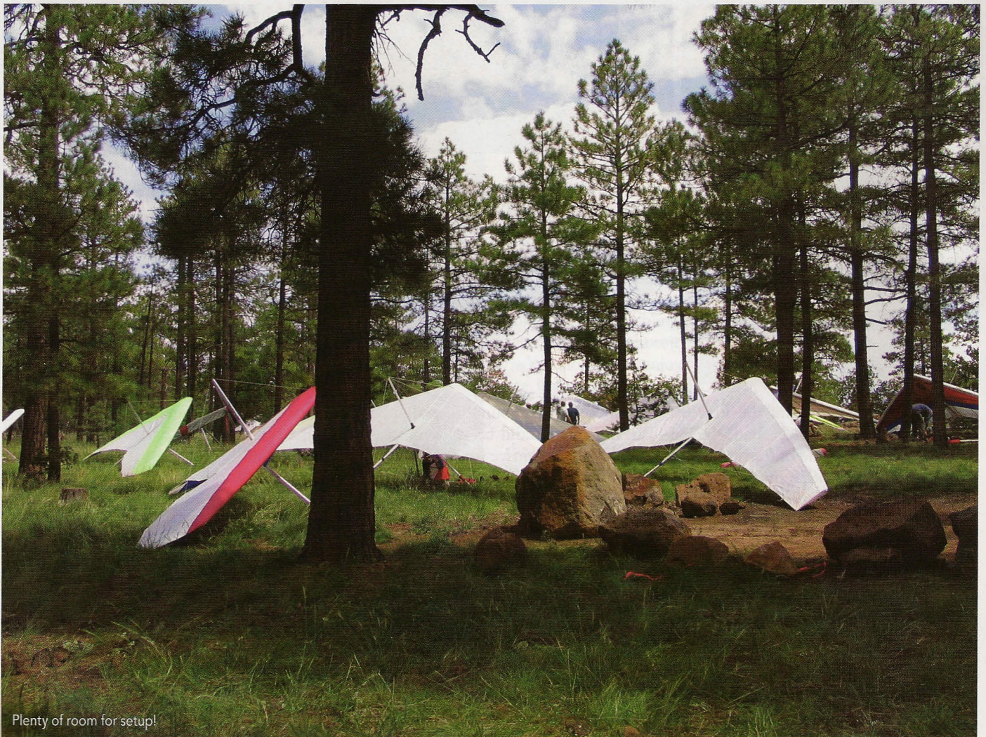
Plenty of room for setup!